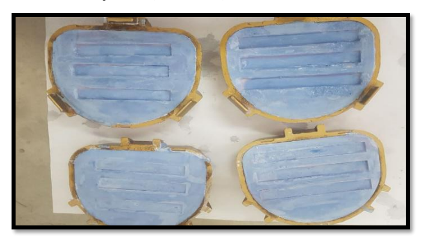
Fig. 2. Mold preparation for impact test specimens