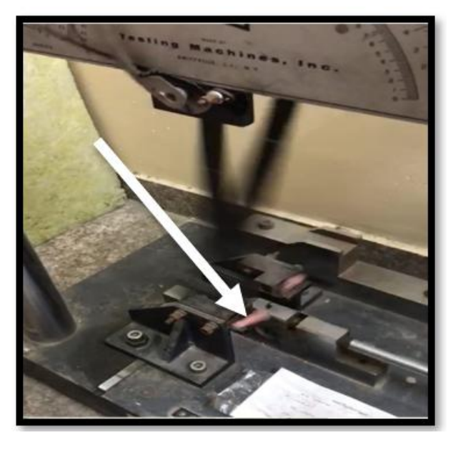
Fig. 4. After impact testing, a position the sample in the test device (Charpy type)