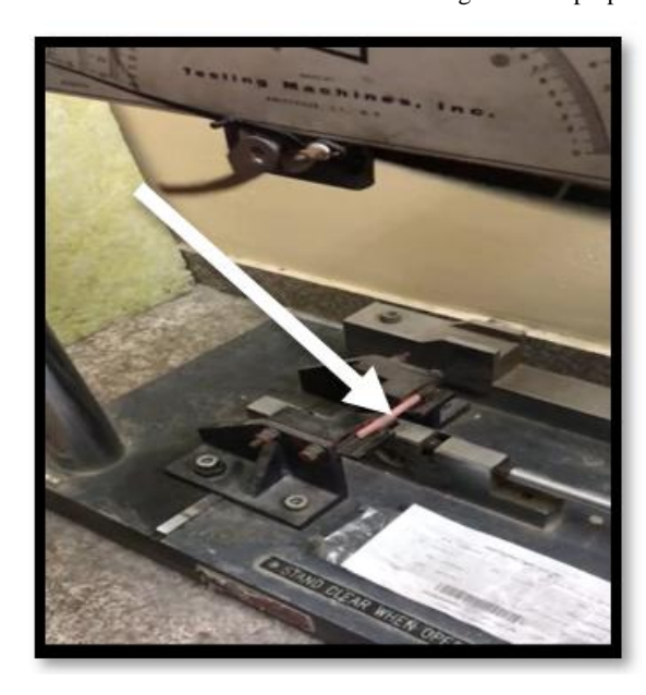
Fig. 3. Before impact testing, a position the sample in the test device (Charpy type)