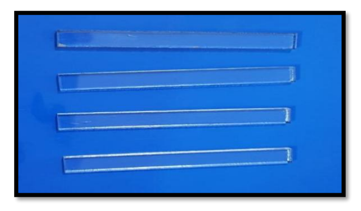
Fig. 1. Plastic patterns for the required impact strength test

In this study, plastic strips were made via cutting plastic plates using the laser-cutting machine as illustrated in Fig. 1. Acrylic samples (80 mm length x 10 mm width x 4 mm thickness) were made according to ISO.179-1, 2000 for unnotched specimens.